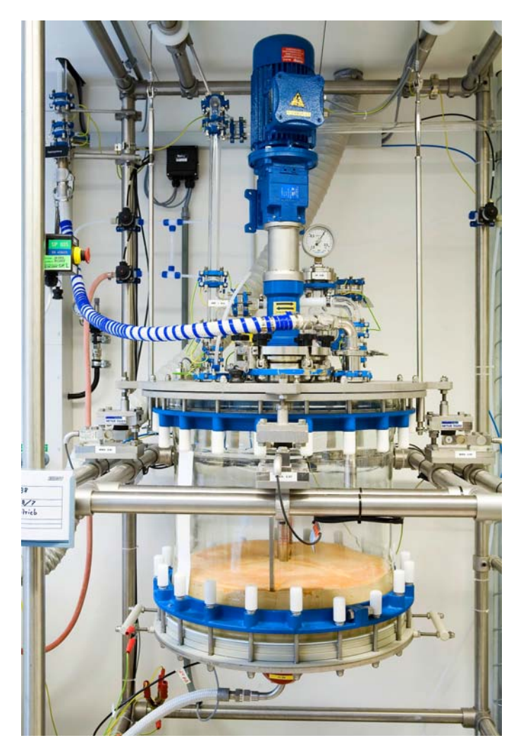
Customized SPPS reactor for Bachem.

In early 2009 Theravance Inc., a South San Francisco based biopharmaceutical company