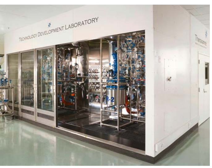
Customized Büchi facility for Theravance.