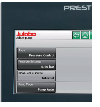
Tip The Ethernet interface permits full access to all operational functions of the PRESTO®.

Make use of the option to regulate the pump pressure. You can define the desired pressure in the PRESTO® settings.